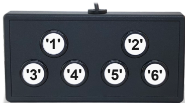
Default MilliKey MH-6 Button to Keyboard Key Mappings